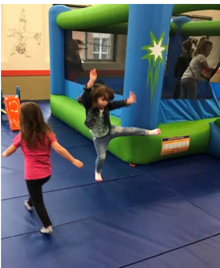
Children enjoy the new bounce house at the YWCA of Titusville

The Saegertown Area Library promotes lifelong learning, self-improvement, and self-expression through their