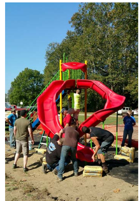
Volunteers help to assemble a new playground in Cochranon

Love In the Name of Christ of Titusville sponsors a