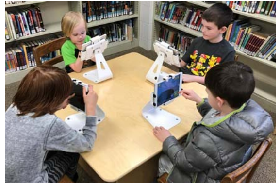
Children learn technology skills with iPads at the Benson Memorial Library

Crawford County Coalition on Housing Needs, Inc.