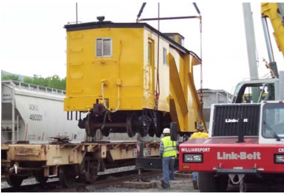
A snow plow rail car is loaded for its trip to Meadville to join a display of historic rail cars in Pomona Park