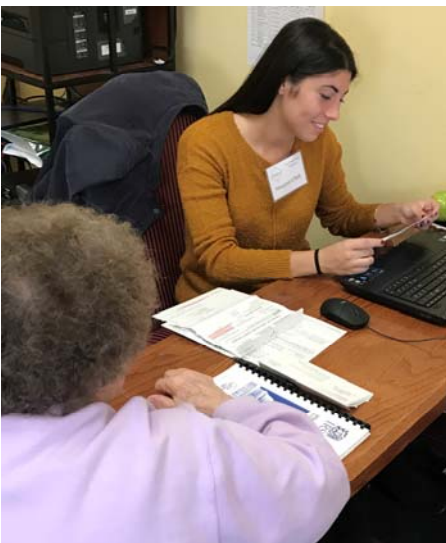
Tax returns were prepared by Allegheny College students for the VITA program

Americans for the Competitive Enterprise System, Inc. (ACES) received $825 to implement the Pennsylvania Business Week program at high